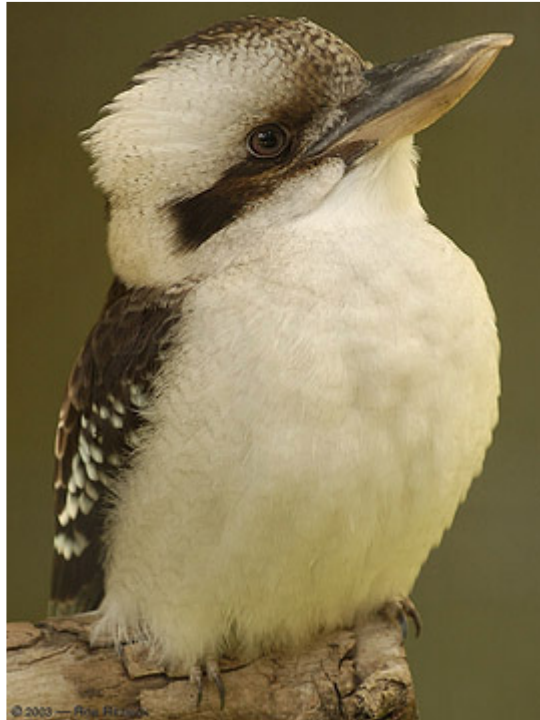
The Kookaburra was shot in shade through closely-spaced wire at 200mm, 1/90 second at f/4. Notice the fine detail of the feathers.