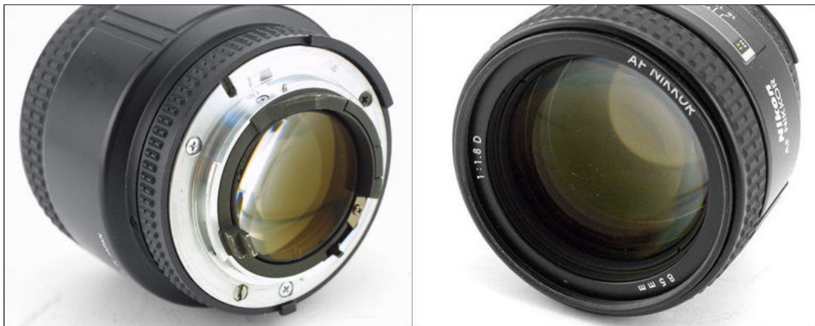
Credit: Images courtesy of shutterblade.com where the Company has a EBAY STORE on its own. For those who may be new to the Nikon system and keep worrying you might be buying an older 85mm f/1.8, don't be. Although whether the AF 85mm is an AF-D or non-D version or not - optically both should behave and deliver the same quality (EXCEPT for a fact, where we assume all newer versions should be treated with Nikon's SIC (super Integrated lens Coating Process) where majority of the older ones could be just being treated with NIC (Nikon Integrated Coating). If you are very determine to find out the differences, an easy identification of the newer AF-D version has an inscription of an additional alphabet "D" behind the lens data, i.e. it reads 85mm 1:1.8D on the lens tube and at the inner filter ring as 1:1.8D. Next, another way is to locate the minimum aperture lock, the newer AF-D version simply has a slide switch to lock the aperture, whereas the previous non-D model has an older twist-lock design. Note: the location of both of these are located at the end (right hand side) of the aperture ring, marked with an orange colored mark.