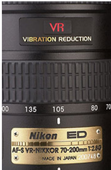
Detail of the lens barrel and zoom ring.

Since this is a G-type lens there is no aperture ring. The rotating tripod collar cannot be detached from the lens, despite the instruction book stating that it can! Instead, Nikon have fitted it with an innovative removable foot that is attached by a dovetail shaped clamp. Immediately in front of the collar are the switches to set the focus mode, focus range and VR functions. Sadly Nikon have chosen to use transfers for the markings that indicate the position of all four switches. I know from experience with other AF Nikkor lenses that with prolonged use these will eventually rub off! The zoom ring has a broad rubberised grip, and is marked for focal lengths of 70, 80, 105, 135, and 200mm. I am pleased to see that these markings are engraved making them far more durable.