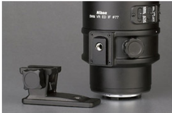
The tripod collar foot (shown detached) clamps onto the dovetailed rails of the tripod collar, which cannot be removed.

The familiar fine gold band, used to denote use of ED glass, is positioned next to the bayonet ring for the dedicated, petal shaped HB-29 lens hood, which comes supplied with the lens, together with the useful and practical soft CL-M2 lens case.