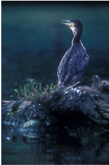
To photograph this Atlantic Cormorant I used the VR 70-200mm in combination with a TC-20E II to give an effective focal length of 400mm. I used my normal technique of shooting with my tripod ball head slackened off, and had the VR set to Normal. F5, Provia 100F, 1/125sec f/5.6 (effective).