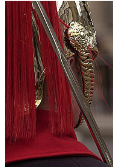
The VR has worked effectively in this close-up of the Trooper's helmet and plume, taken at 200mm 1/30sec at f/11.

Nikon claim an effective gain of 3 stops faster shutter speed by use of the VR. Granted this is a very subjective issue as a person's ability to hold a lens steady will depend on a number of factors, however, I have to say that I find with the AF 80-400mm lens that 2 stops is a more reasonable estimate. I know it is early days but this lens appears to have a more effective VR capability (see example pictures) as shooting digitally I was able to obtain a sharp result at the longest focal length, equivalent to a 300mm lens, down to 1/15 second. The Active VR mode is also very effective at suppressing higher levels of exterior vibration such as those you will encounter when working from a motor vehicle or helicopter. For me the really good news is that the VR will operate, in Normal mode, when the lens is used on an unsecured tripod head, or monopod.