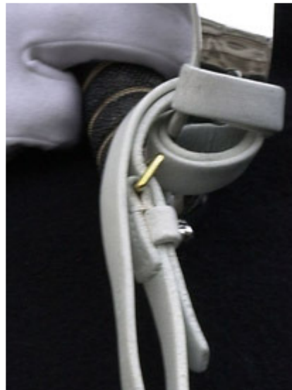
With the VR switched off this detail shows a considerable amount of softness due to camera shake.