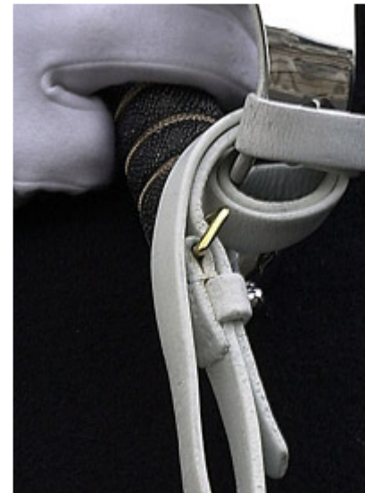
With the VR set to Normal the improvement in sharpness is impressive.