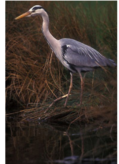
Grey Heron, another shot taken with the 70-200mm and TC-20E II using the VR function whilst pivoting the lens on the ball head of my tripod. F5, Provia 100F, 1/125sec f/5.6 (effective).