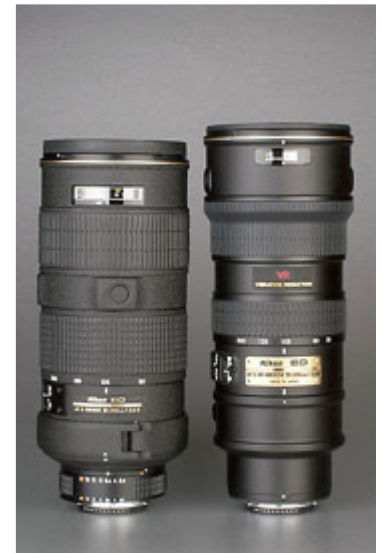
The current AF-S 80-200mm f/2.8 and the new VR 70-200 f/2.8 lens (right), although slightly longer the VR version has a more streamlined profile.

The VR function is only available with the F5, F100, F80, F65, D100, and D1 series cameras. Nikon have obviously listened to feedback on their first VR lens the AF 80-400mm f4.5-5.6D, because the VR functionality of this lens has been overhauled substantially. Thankfully, Nikon have dispensed with the Mode II option of the 80-400mm, which activated the VR system at the moment of exposure. I was never convinced by this feature, and found that it would frequently cause slight changes to precise compositions, which you could not observe in the viewfinder. On this lens the VR is either off, or on, all the time. If you chose to use the VR there are two options available; Normal, that is intended to reduce the effects of camera shake, whilst still allowing for smooth panning shots when only vibration in the plane perpendicular to the panning movement is suppressed, and Active, that helps to reduce the more vigorous vibrations you may encounter when working from a moving camera platform such as a motor car, boat, or helicopter. It is important to note that in this mode the lens does not distinguish panning movement from camera shake. So always set the VR to Normal for panned shots. One idiosyncrasy of the VR systems is that when used with the F65, F80, and D100 it will not work whilst a flash unit is recycling.