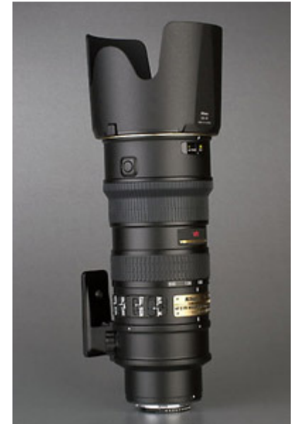
AF-S VR 70-200mm f/2.8G IF-ED

The lens' optics provide a picture angle of 34°20' - 12°20' (22°50' - 8° with Nikon digital SLR cameras), and has a minimum focus distance of 1.4m in manual focus (MF) and 1.5m in Auto Focus (AF). At the longest focal length setting this provides a maximum reproduction ratio (RR) of 1:5.6 at 1.4m (MF), and 1:6.1 at 1.5m (AF). The lens is 87mm in diameter, 215mm long, and at 1430g