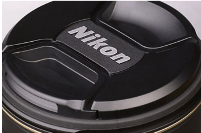
The new style lens cap with a centre-pinch clamp.

Finally, the lens is compatible with the AF-I and AF-S teleconverters, TC-14E/TC-14E II/TC-20E/TC-20E II, and the AF and VR functions are retained, in full, with a teleconverter attached.