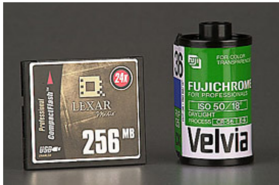
This is the full frame coverage with the lens set to its longest focal length and MFD, with a TC-14E II attached, mounted on a D1X.