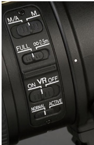
The array of switches that control focus and VR functions.

(with the tripod mounting foot) is 10% lighter than the current AF-S 80-200mm f/2.8 model.