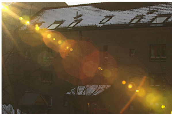
70 mm f/22

At least 15 hot-spot ghosts (from each lens group?) together with a plethora of larger secondary ghosts make an ugly impression.