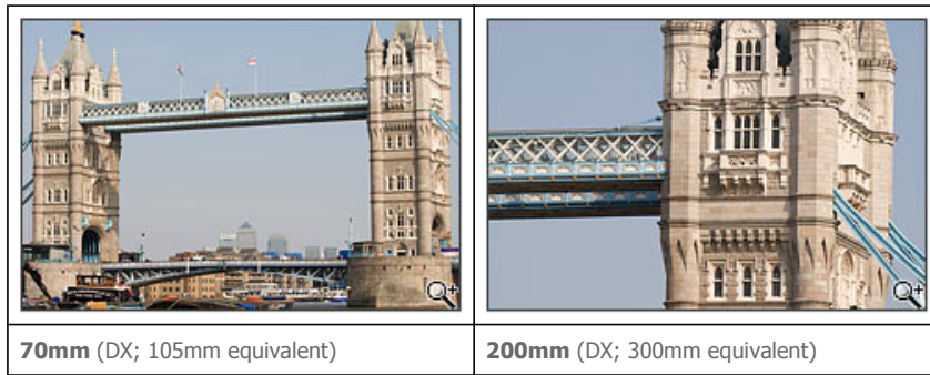
70mm (DX; 105mm equivalent)