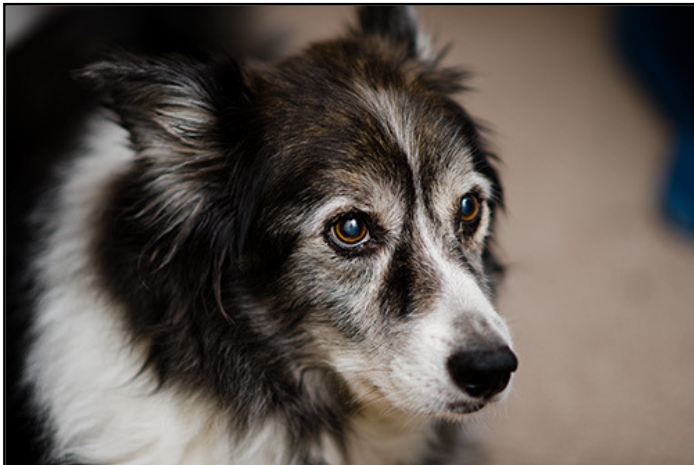
Nice, contrasty and sharp

DEFOCUS CONTROL: The 135mm, like Nikon's 105mm f/2, has a special trick called "Defocus Control." What this essentially does is use multiple focal planes to give your subjects a hazy glow without being exactly out-of-focus. Here's an example at it's most extreme. First, without the effect applied, and then one at the maximum setting: